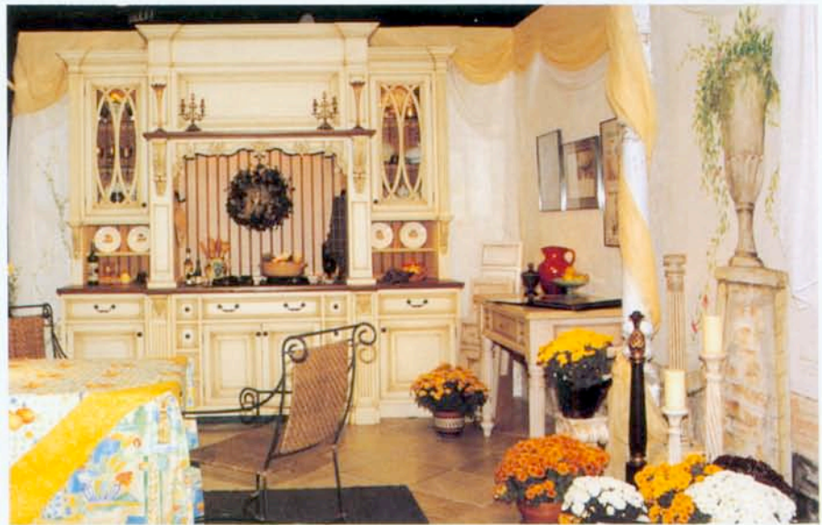
ABOVE: This display by Kitchen Design & Consulting, Inc. was a highlight of the "Washington Home Design & Furniture Show." Cabinetry is By Premier Custom Built.