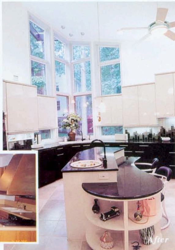
BELOW AND RIGHT: A claustrophobic space is transformed into a dynamic interplay of line, form and function.

Please call 703-242-0330 for further information.